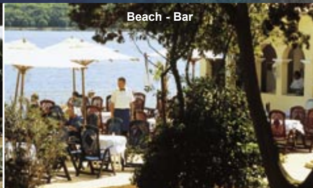
Beach - Bar