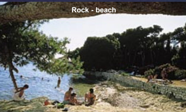
Rock - beach