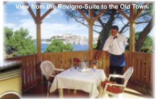
View from the Rovigno-Suite to the Old Town.

The Hotel Katarina villas are romantically situated in the 100-year-old forest on Katarina Island!